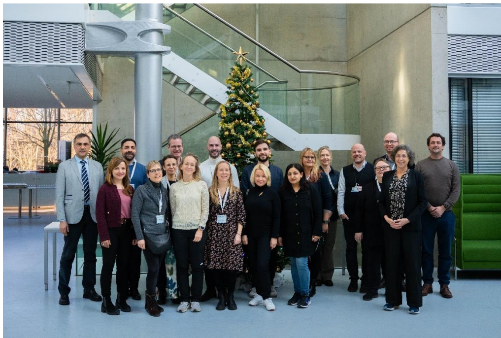
Fig. 1 | The delegation and local hosts.